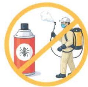
Avoid sprays when possible