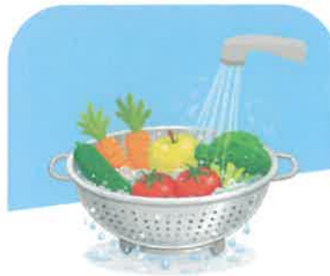
Wash fruits and vegetables