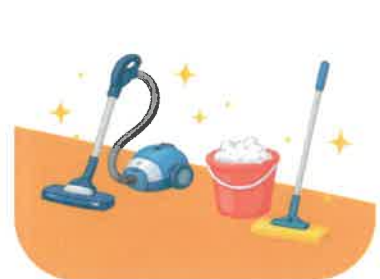
Vacuum carpets; mop floors