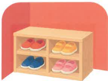
Take off shoes inside